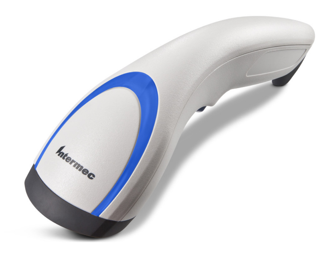
Designed to meet the needs of healthcare, the SG20 scanner helps you consistently meet patient safety standards.

The SG20 family includes the option of either a Bluetooth wireless or tethered (cabled) scanner, and a choice between